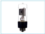
Deuterium Lamp: Ultraviolet light source