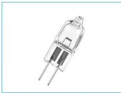
Tungsten Lamp: Visible light source